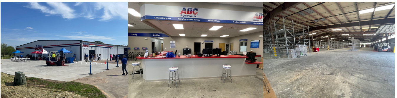
ABC Supply Co. Inc. N. Pearson Road