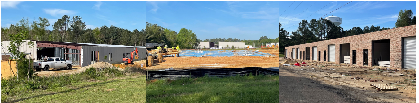
Son Seekers Concourse Drive